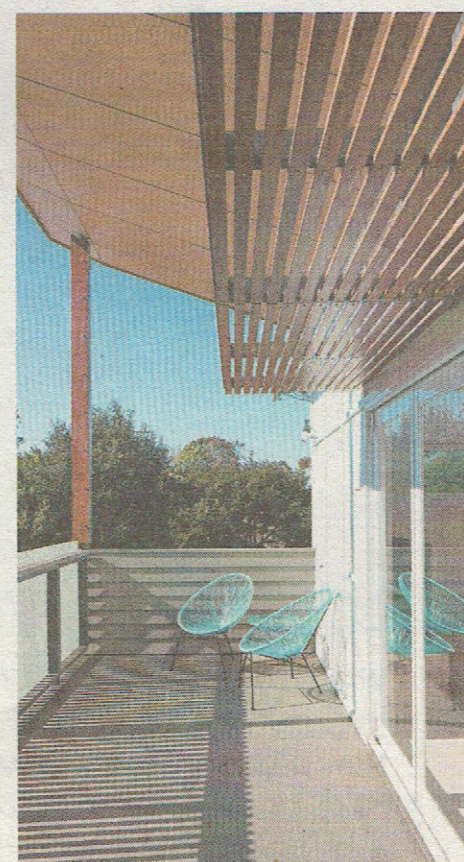
The new deck has been designed with summer and winter sun in mind.

be with subcontractors that the builder is using for the first time — or at the last minute,” he says.