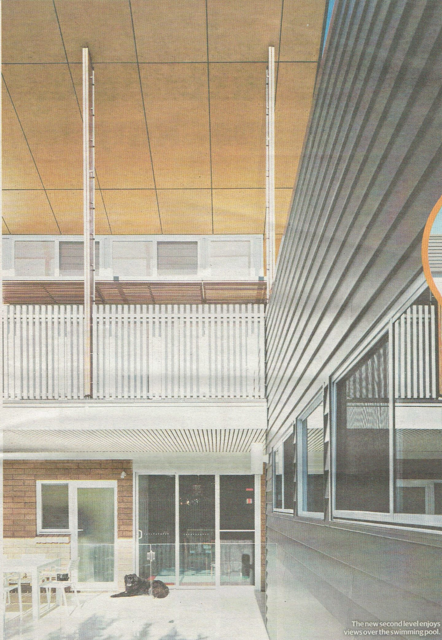
The new second level enjoys views over the swimming pool.